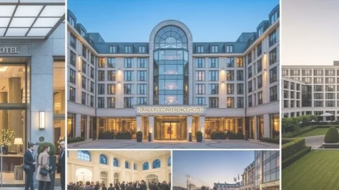
IELTS LISTENING – Flanders Conference Hotel S20T1 July 7, 2025 In "IELTS Listening Easy Demo for All"