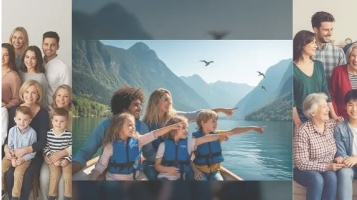
IELTS LISTENING – Family Excursions S22T1 July 8, 2025 In "IELTS Listening Easy Demo for All"