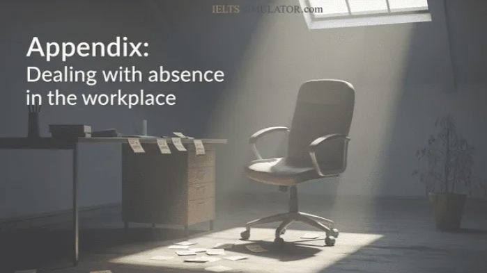
IELTS READING – Appendix: Dealing with absence in the workplace S13GT4 August 12, 2025 In "IELTS Reading Easy Demo for GT"

8439000086 8439000087 7055710003 7055710004 IELTS Simulation 323 GMS Road, Near Ballupur Chowk, Dehradun, India Chat on WhatsApp email: info at ieltsband7.com