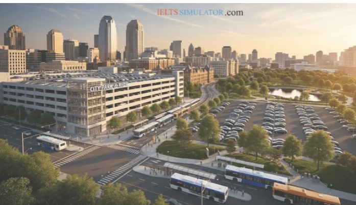
IELTS READING – City Park and Ride S12GT2 August 11, 2025 In "IELTS Reading GT – Format, Tips, and Practice for General Training"