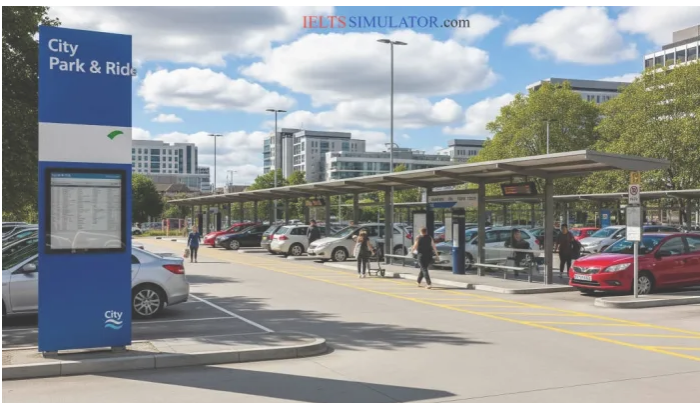
IELTS READING – City Park and Ride S10GT2 August 8, 2025 In "IELTS Reading Easy Demo for GT"