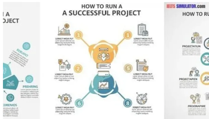
IELTS READING – How to run a successful project S4GT4 August 1, 2025 In "Top 10 IELTS Reading Tips to Improve Band Score Fast"