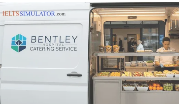
IELTS READING – BENTLEY HOSPITAL CATERING SERVICE S25GT2 August 23, 2025 In "Top 10 IELTS Reading Tips to Improve Band Score Fast"