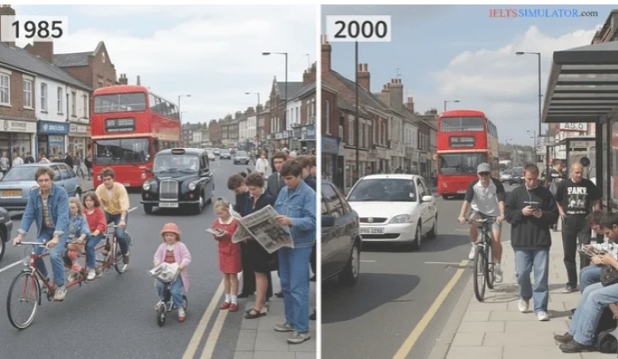
IELTS WRITING – Changes in Modes of Travel in England Between 1985 and 2000 S34AT1 September 1, 2025 In "IELTS Academic Writing – Task 1 & 2 Format, Tips, and Sample Answers"