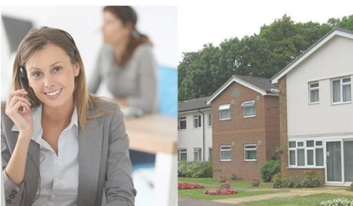
IELTS LISTENING – Hilary Lodge Retirement Home S12T1 July 1, 2025 In "IELTS Listening Easy Demo for All"