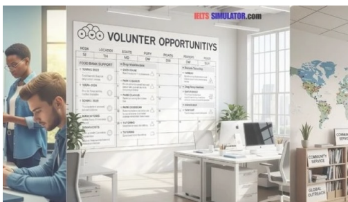
IELTS LISTENING – An Organisation that Arranges Volunteering S20T2 July 7, 2025 In "IELTS Listening Easy Demo for All"