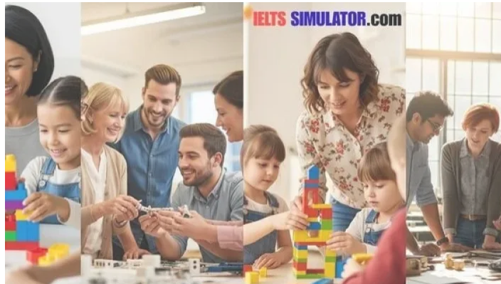
IELTS LISTENING – Helpline Details S50T2 July 15, 2025 In "IELTS Listening Easy Demo for All"