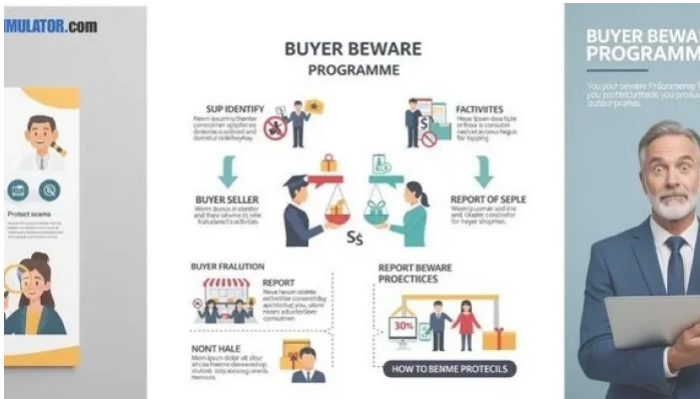
IELTS LISTENING – “Buyer Beware” Programme S29T2 July 9, 2025 In "IELTS Listening Easy Demo for All"