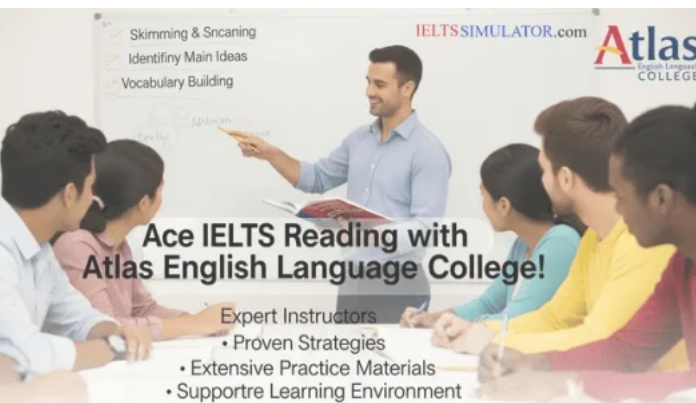
IELTS READING – GOOD REASONS FOR CHOOSING ATLAS ENGLISH LANGUAGE COLLEGE S21GT4 August 19, 2025 In "IELTS Reading GT – Format, Tips, and Practice for General Training"