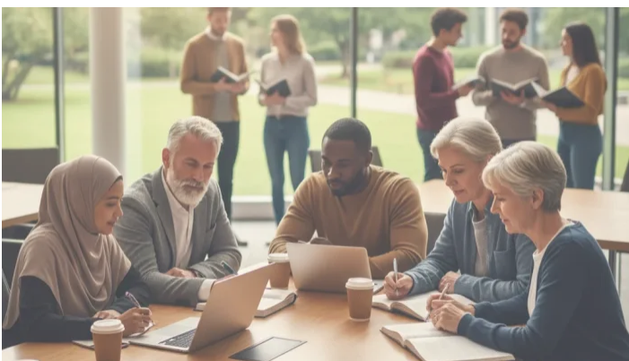
IELTS READING- Get back into education! S36GT1 November 6, 2025 In "IELTS Reading Easy Demo for GT"

Tagged IELTS Academic Reading , Top 10 IELTS Reading Tips to Improve Band Score Fast